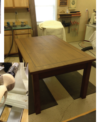
Todd's famous kitchen table