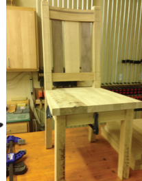
Kitchen chairs project